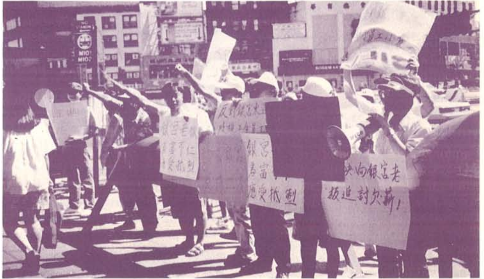
Angry workers resist the Silver Palace restaurant's attempt to lock them out and cut their benefits.

Nine good-faith attempts to negotiate a fair contract ended with management storming out of the meetings. In violation of federal labor law, the managers threatened to fire members of the bargaining committee if the contract was not signed by August 20th. That day, management locked out more than 40 workers and called the police to arrest those who were demanding payment of withheld wages and vacation pay. One of the