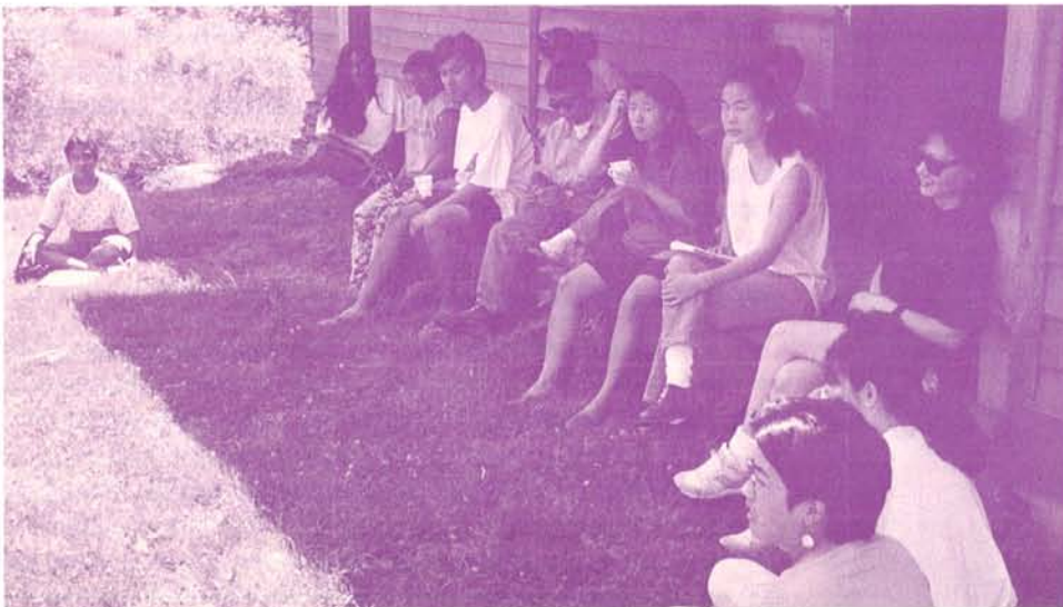
CAAAV in the Catskills: Summer retreat participants take a break from the city.