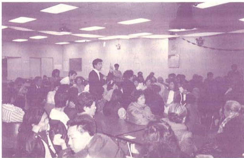
Vietnamese and Khmer residents of the Bronx faced the police at a meeting on March 11 held by CAAAV and the St. Rita's Asian Center.

In this context, the English classes are critical, because they will help the tenants to become an integral part of the Woodside community. On a practical level the classes are useful in arming the