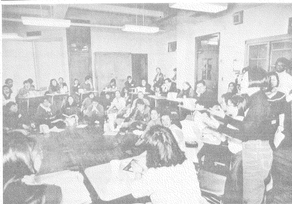
About 150 Asian Americans joined over 1000 people at the ambitious North Star conference, Organizing for Social Change: Fighting Racism & the Politics of Division , on February 27 & 28. CAAAY members helped organize 3 workshops - above is It's An Asian Thing!