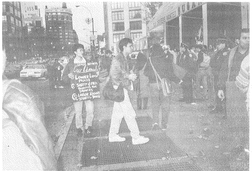
CAAHV and LDC members protesting against the owner of Susan's Maintenance for his unfair firing and beating of his employees.

Students, most of whom recently immigrated from China or Hong Kong over the past two years, discussed the problems and hostility they face at school. They described the constant harassment by other students who jumped them in the hallways, shook them down for money, and taunted,