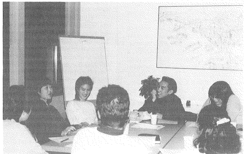
CAAAV Outreach Committee meeting

we learn from World War II?" The event will highlight the frightening similarities between the racism and repression against Japanese Americans in World War II and Arab Americans today. This event will be part of CAAAV's efforts to bring Asian Americans into the burgeoning movement against the war - a war motivated