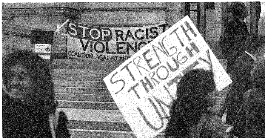
Rally in Jersey City on October 1, 1988.