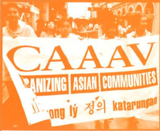
CJP Youth Members during the RTTC National Expression March holding our banner, which wound its way through downtown Miami and ended up at the hotel where the U.S. Conference of Mayors was meeting.

Launched in 2007, Right to the City (RTTC) national alliance came together under a common framework to increase the strength of our community organizations and our collective power. Our goal is to build a national urban movement for housing, education, health, racial justice and democracy. In the past year, RTTC has developed and grown in exciting ways. The RTTC national members came together in February and decided to have three “National Expressions” – events and actions around gentrification that would build on one another and provide opportunities for groups nationally to work together.