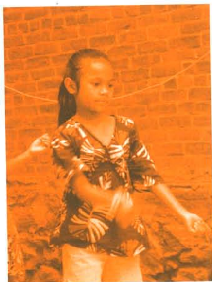
Above photo and photos on next page: YLP youth members at Youth Leadership Summer Event

* Please see our "Alliance Updates" section for more information on DWU's work.