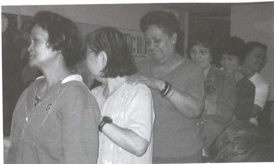
WWP members at Health Fair in Woodside, Queens in May 2008

The Women Workers Project (WWP) continued to work with the Domestic Workers United (DWU) to pass the "Domestic Workers Bill of Rights," a State-wide bill to establish labor standards for domestic workers, including health care and basic benefits. Excluded from many federal and state labor laws, the "Bill of Rights" would bring long overdue respect and recognition to the domestic workforce. WWP participated in various aspects of the Bill of Rights campaign, including garnering support from students, faith-based communities, and unions, and conducting workshops. In the spring of 2008, WWP also joined Domestic Workers United and their supporters (including AFL-CIO President John Sweeney) as they traveled to Albany for their "Day of Action" that called on State legislators to support the Bill of Rights.*