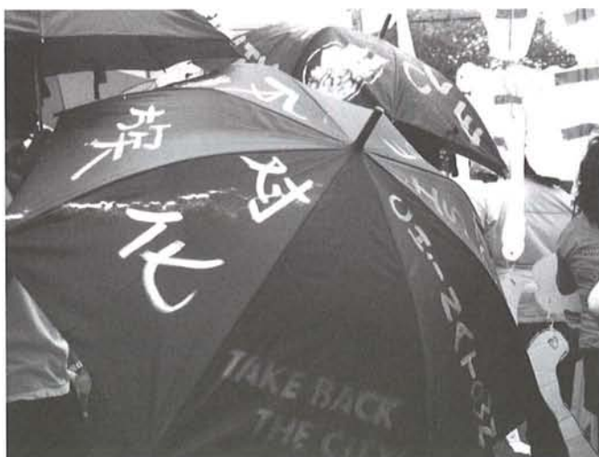
CJP members in Miami for the RTTC National Expression in July 2008: RTTC held a spirited march and rally in the midst of a torrential downpour

ncial crisis that is redefining the U.S. and world economies. Much of the gentrification that our community has experienced has come as a result of reckless real estate speculation, facilitated by global capital. As the national economy struggles to adjust to the current crisis, our sense is that the government will continue to play some role in bailing out floundering financial companies. How this will impact our community—in terms of services, quality of housing, and major development projects—is still unclear, but we believe that the aftershocks will begin to manifest themselves in ways that highlight the contradictions of years of unchecked and illusory growth.