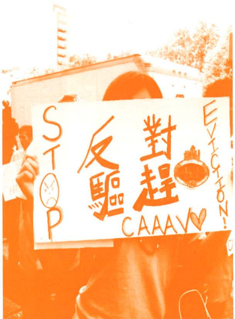
CJP youth member holding up a sign from the commemoration of the 3rd Anniversary of Hurricane Katrina in Chinatown, August 29, 2008

All this is occurring in the context of the current fi-